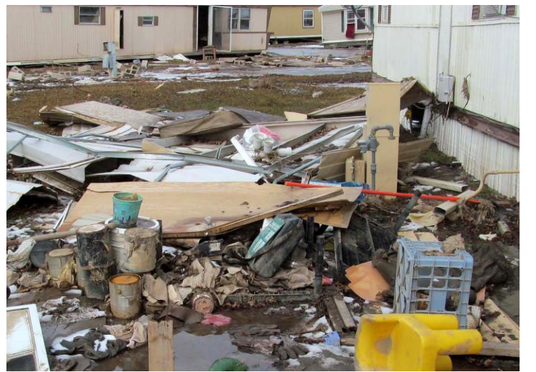
County inspection teams entered the Eastwood Village park on January 30, 2014, and found mold in homes (left) as well as trash and household hazardous waste throughout the neighborhood (right).