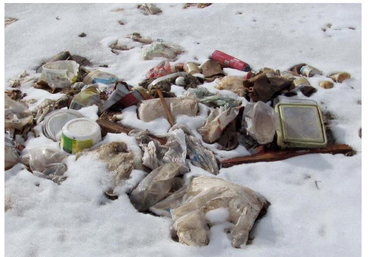
A letter from the Weld County Department of Health sent to the landowners of the parks warns of “...increased risk of disease, offensive odors, as well as increased presence of rodents and other disease causing varmints...” if the parks are not cleaned up.