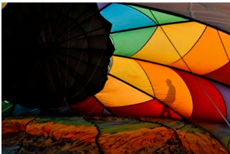
Frederick in Flight will take place June 22-23 in Frederick’s Centennial Park this year.

WELD COUNTY, CO – The Weld County Board of Commissioners will launch a new web site on May 1, 2013, to highlight the attractions, events and people of Weld County. The site, www.discoverweld.com, is designed to be updated monthly with new features showcasing life in Weld.